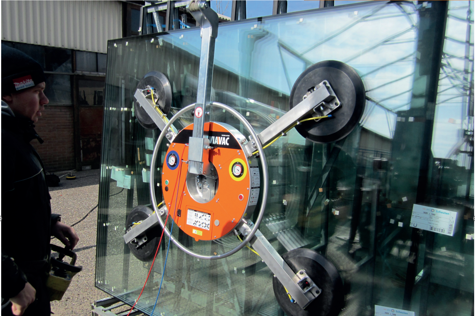
VACUUM GLASS LIFTER