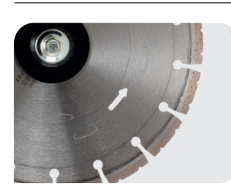
SPECIALLY DEVELOPED BLADES

Unique battery blades with 100 mm cutting depth.